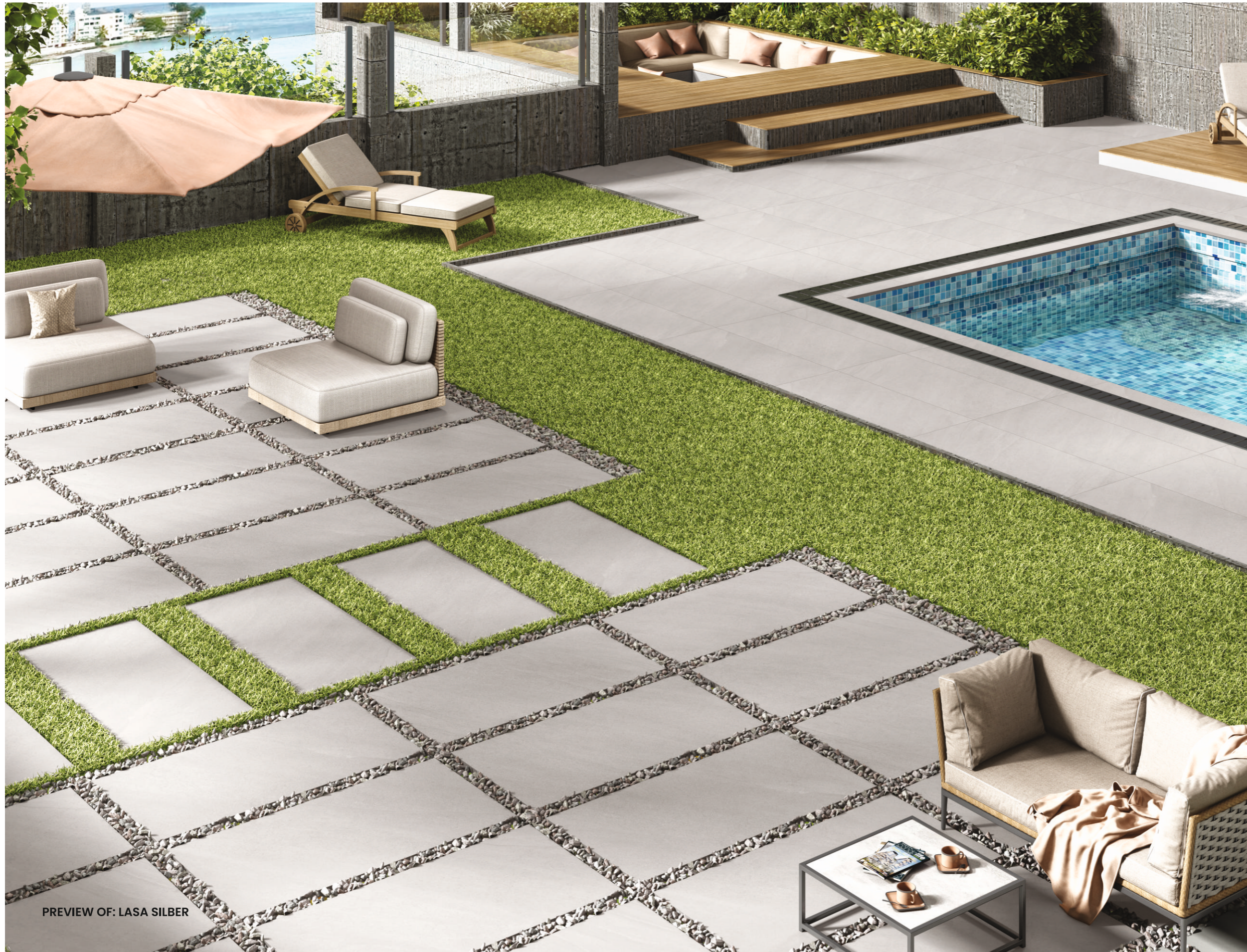
PREVIEW OF: LASA SILBER